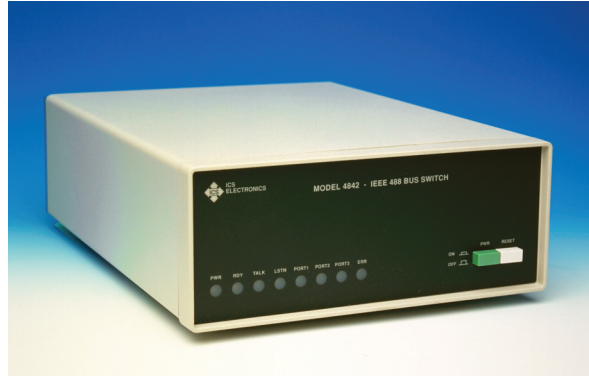
4842 Bus Switch

ICS's 4842 GPIB Bus Switch is a GPIB controlled switch that enables several GPIB Controllers to share one or more GPIB device(s) or lets a single GPIB Controller operate multiple Bus systems. The 4842 is basically a GPIB controlled A-B-C switch for the GPIB bus. As a Multiplexer, the 4842 lets multiple Bus Controllers connected to the numbered ports share the common bus and any devices attached to it. When used as a Bus Switch, the 4842 lets a GPIB Controller connected to the common port select and control devices attached to the numbered ports. Figures 1 and 2 show these two operating modes.